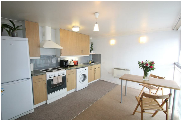
KITCHEN / LIVING SPACE